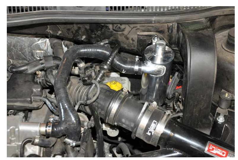
10. If You Choose To Vent To Atmosphere, Install The Breather Filter Onto The Can, Remove The Factory Check-Valve And Replace With Provided Plug.