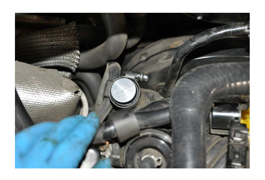
11. If You Choose To Recirculate, Retain The Factory Check-Valve And Install The Provided 034Motorsport Silicone Hose