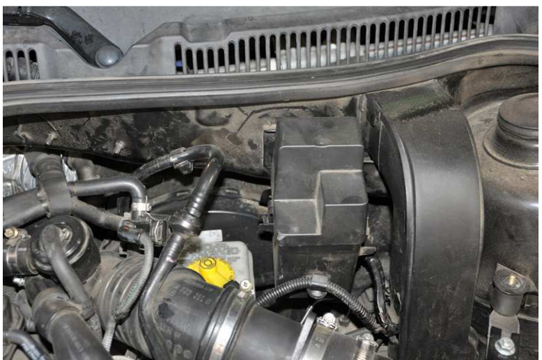
3. Remove Both Top & Bottom Relay Panel Covers