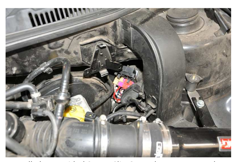
5. Install The Provided Screw Clip Onto The Factory Bracket