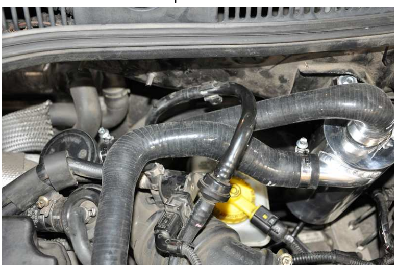
12. Install The Oil Drain Fitting Between The Turbo Oil Drain Line And Oil Pan