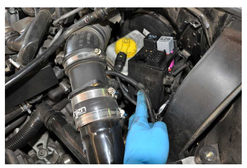
4. Tuck Relay Panel Underneath Mounting Bracket Near The Firewall For Added Security, You Can Zip-Tie The Relay Panel To The Tab On The Lower Right Hand Corner Of The Mounting Bracket