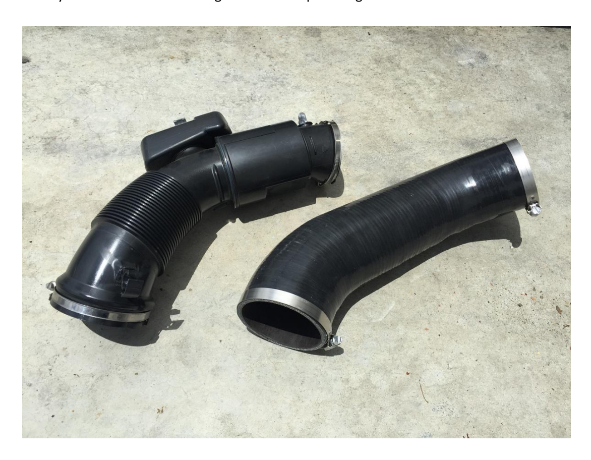
Step 7 – Install the 034Motorsport High-Flow Silicone Throttle Body Inlet Hose and tighten the supplied clamps.