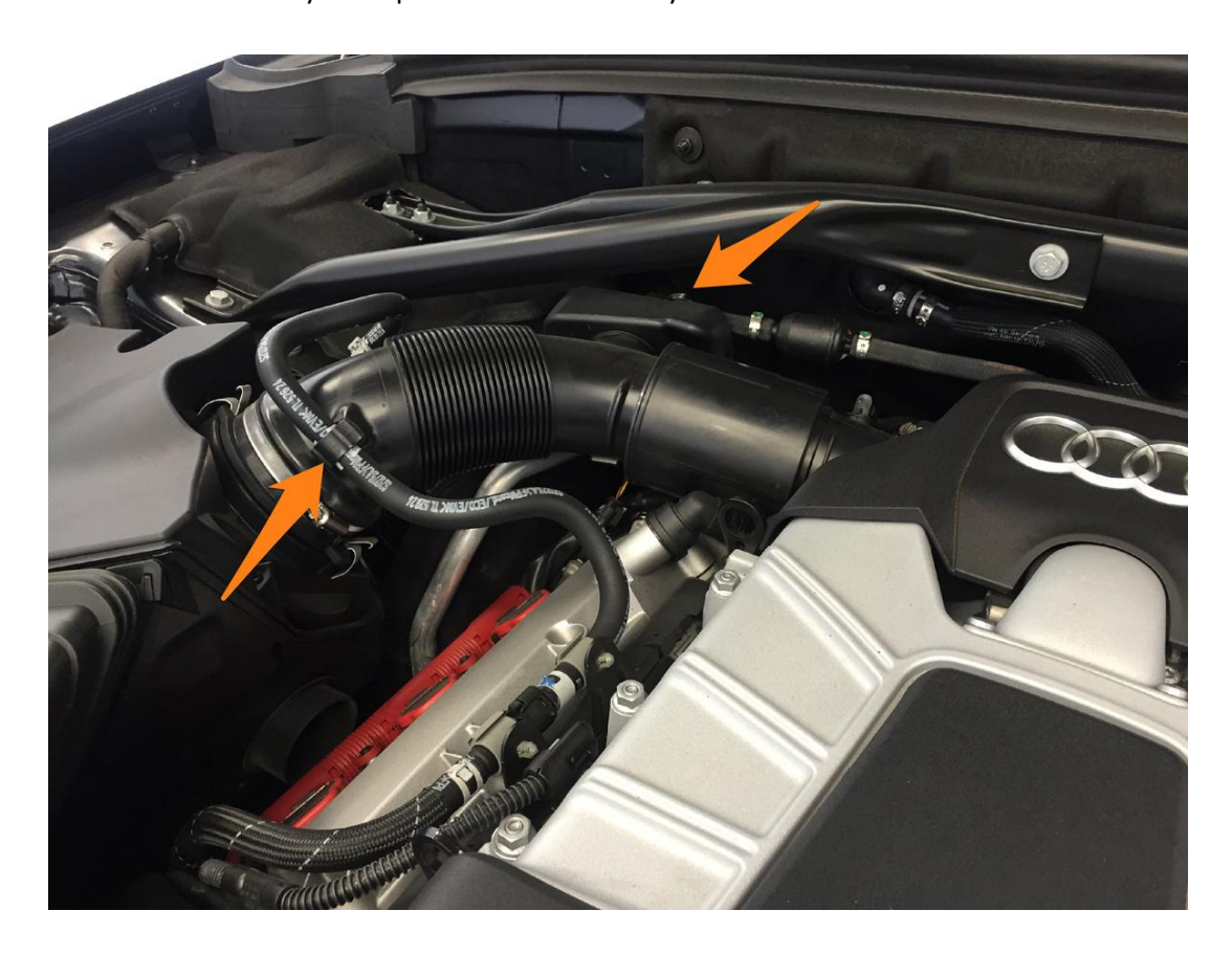
Step 3 – Carefully unhook the small vent hose near the throttle body. Twisting it on the barb may break it loose.