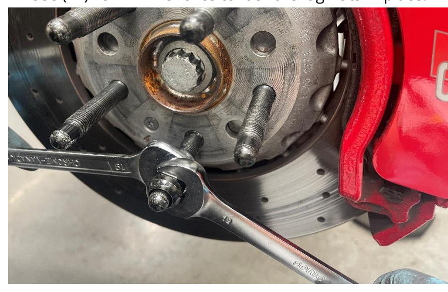
Step 8 Using a 19mm wrench, tighten the whole assembly from the outermost lug nut.