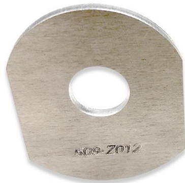
Lower Dogbone Mount Insert Spacer