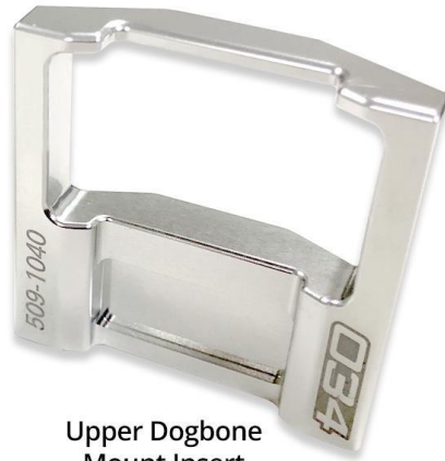
Upper Dogbone Mount Insert