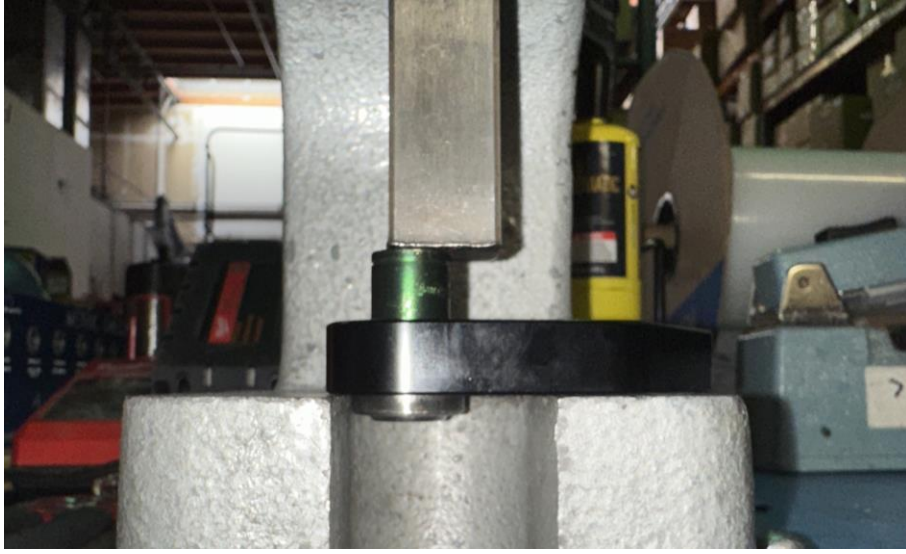
Step 3 Thoroughly clean the bore where the old bearing was secured.

Position the end link under the arbor press such that the bearing can be pushed out, downward. Using a 13mm socket, carefully press the bearing out.