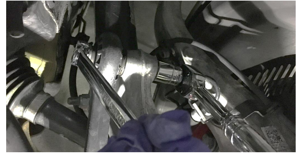
Step 4 Lower the car back down to access the remaining hardware.

Using a 16mm wrench and socket, remove the bolt connecting the upper end link to the strut base.